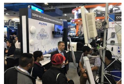
Altai @ Expo Seguridad