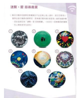
These beautiful patterns are painted on Altai A3c's

The Boys' and Girls' Clubs Association of Hong Kong ("BGCA") is a charity organization established in 1936 and mainly serves children and youths. With the mission of "Nurture the Young Create the Future", the Association offers support during their growth, equipping them with skills and helping to build their development assets.