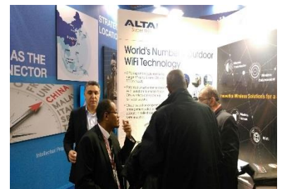
Altai @ Mobile World Congress

Altai participated in Mobile World Congress at Barcelona, Spain (Feb 27 – Mar 2) and Expo Seguridad at Mexico (Mar 14-16). Altai's participation at the Mobile World Congress was a great success. Many partners and visitors from different parts of the world visited Altai's booth to understand the newest Super WiFi technologies and solutions.