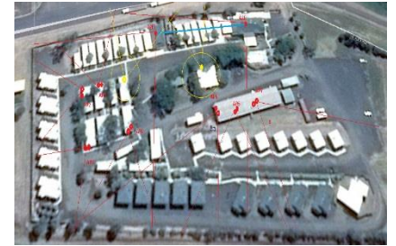
Both network operator and park owner can easily manage the network and generate recurring income through AltaiCare.

The Wandoan Accommodation Park is just off the Leichhardt Highway on a very popular inland route heading north towards tropical Queensland. The 3.5 acre landscaped park caters for caravans and camping but also provides 3 to 4 star cabins, suites and apartments for those who prefer to maintain their standards whilst getting back to nature.