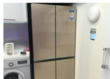
Altai A3w's plug & play design allows fast installation and deployment

Altai was invited by the Hong Kong Science Park to provide WiFi connection in its Smart Living showroom using Altai C1n and A3w - the latest 802.11ac indoor product. The Smart Living showroom aims to demonstrate the concept of a smart home using WiFi to connect with various applications in one place, making life easier with all these advanced technologies. The Smart Living showroom will open to public from now till mid Apr 2016.