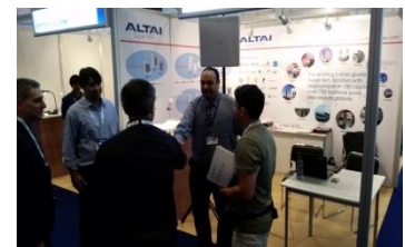
Alta @ GITEX 2015

Altai recently participated in various events in Dubai, U.S. and South Africa. Altai showcased its latest 802.11ac products and AltaiCare in GITEX at Dubai, the feedbacks from visitors on these new Super WiFi products were very positive.