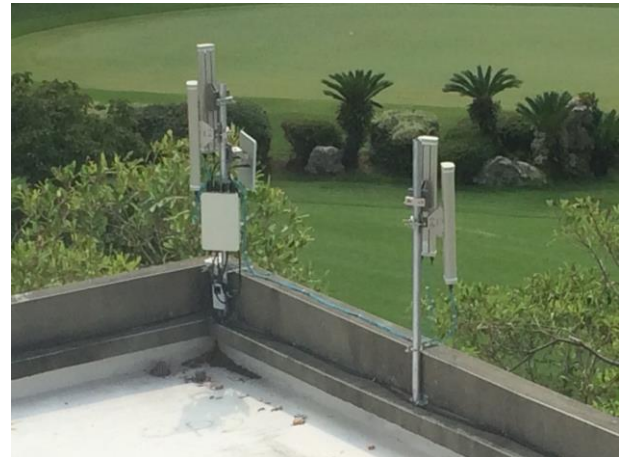
(Picture: A single unit of A8n was installed with 5 sector antenna to cover 360 degree (up to 1km (LOS) and 500m (NLOS) for dual band dual concurrent on 2.4Ghz & 5.8Ghz)

Besides, trees, vegetation are extremely difficult and challenging for any wireless deployment since all plants absorb signal. But with Altai's patented algorithms and smart antenna technology, all these problems can be overcome in providing high speed, reliable wireless internet access for this special environment.